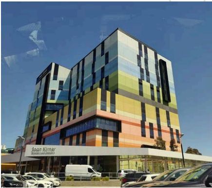
Joan Kirner Women's and Children's Hospital